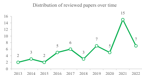
FIGURE 2. NUMBER OF JOURNAL PAPERS PER YEAR

The identified papers comprise 56 articles published between 2013 and 2022. Sustainability in disaster relief operations was initially explored by researchers like Green et al. [20]. More recently, Kunz and Gold [7] have also contributed to this field of study. An increasing number of sustainability studies have emerged since then (see the distribution of papers per year in Fig. 2). There are two phases of the development trend in this literature: a) an early dissemination phase from 20013 to 2018, and b) a development phase from 2018 to 2022, with a substantial upward trend in the number of publications per year.